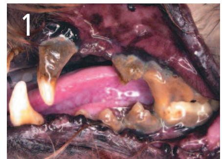
Stage 4 periodontal disease. Local disease is obvious, with profound tartar accumulation, gingival recession, and purulent debris and plaque present in the sulcus.