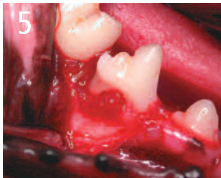
Surgical exposure of a defect in a patient similar to that in Figures 3 and 4. Granulation tissue is seen occupying the void created by periodontal bone loss. <<Author: Add arrow, please>>