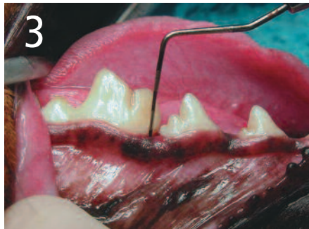
No obvious evidence of periodontal disease is present in this patient.

may appear normal despite underlying disease, defining the need for periodontal probing and radiography (Figures 3–5).